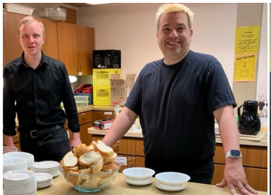
Our Kitchen Team