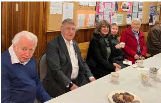
Our St. Peter's Friends and Family

Consequently, the Coffee and a Chocolate for You event was rescheduled to Sunday, January 26 th due to similar reasons as above. At least this time, no one went to the wrong location on account of the short rescheduling notice. As for the highlight of this event, it was the mingling! We all mingled, tingled, and jingled up a storm as we munched away on goodies, sipped some hot coffee, and basked in each other's joyful presence.