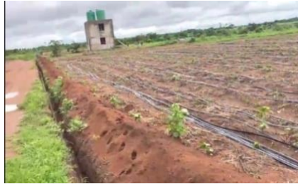
Pipes are in place with a new water tower