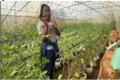
The greenhouse is ready

Kuwala is enhancing agricultural output and achieving food self-sufficiency. It has a new water tower at the farm to develop water irrigation and retention and management systems to mitigate the effects of increasing drought periods.